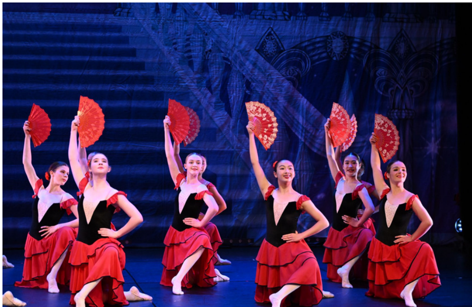
Ecole's 2022 Senior End of Year Performance, The Nutcracker . Pictured are SL7 Ballet Students

Grade 5 Ballet twice per week, Grade 5/6 Ballet, Senior Level 6 Ballet, Senior Level 7 Ballet, Senior Level 8 Ballet, Senior Level 9 Ballet, Teen Elementary Ballet, Year 6 Lyrical, Year 7-9 Lyrical, Year 6 Jazz, Year 7 & 8 Jazz, Senior Block Year 9 & 10, Year 6 Hip Hop, Year 7 & 8 Hip Hop, Senior Block Year 11+, Year 5 & 6 Tap, Year 7-9 Tap, Year 5 & 6 Musical Theatre, Year 7-9 Musical Theatre, Intermediate/Advanced Acro & Advanced Acro (Tuesday)