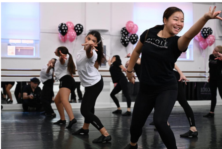
Ecole's 2023 Open Day. Students from our Year 9/10 Senior Block class performing a Jazz routine

Our Open Day 2023 web page contains a short video of the day as well as photos and a list of all of our lucky winners from the day. Please take a moment to have a look.