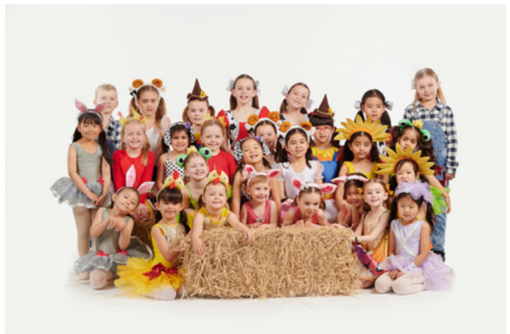
Ecole's 2022 Junior End of Year Performance, Farmyard Friends

There will be NO regular classes for Junior School Students on Saturday 21 October. We will see all students at the Theatre! Detailed information regarding the Junior School EOYP and the approximate timings will be sent out in the coming weeks via email.