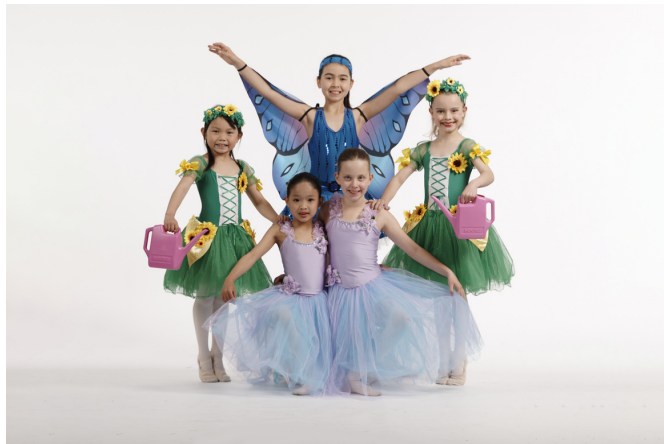
Ecole's 2022 Middle School End of Year Performance, The Enchanted Garden

The following classes are involved in the Middle School End of Year Performance and Photo Day Grade 1 Ballet once per week (Wednesday & Thursday), Grade 1 Ballet twice per week, Grade 2 Ballet once per week, Grade 3 & 4 Ballet once per week, Grade 3 Ballet twice per week, Year 2 & 3 Lyrical, Year 4 & 5 Lyrical, Year 2 Jazz, Year 3 Jazz, Year 4 & 5 Jazz, Year 2-4 Tap, Year 2-4 Musical Theatre, Year 4 & 5 Hip Hop, Acro Intermediate Friday, Classical Group