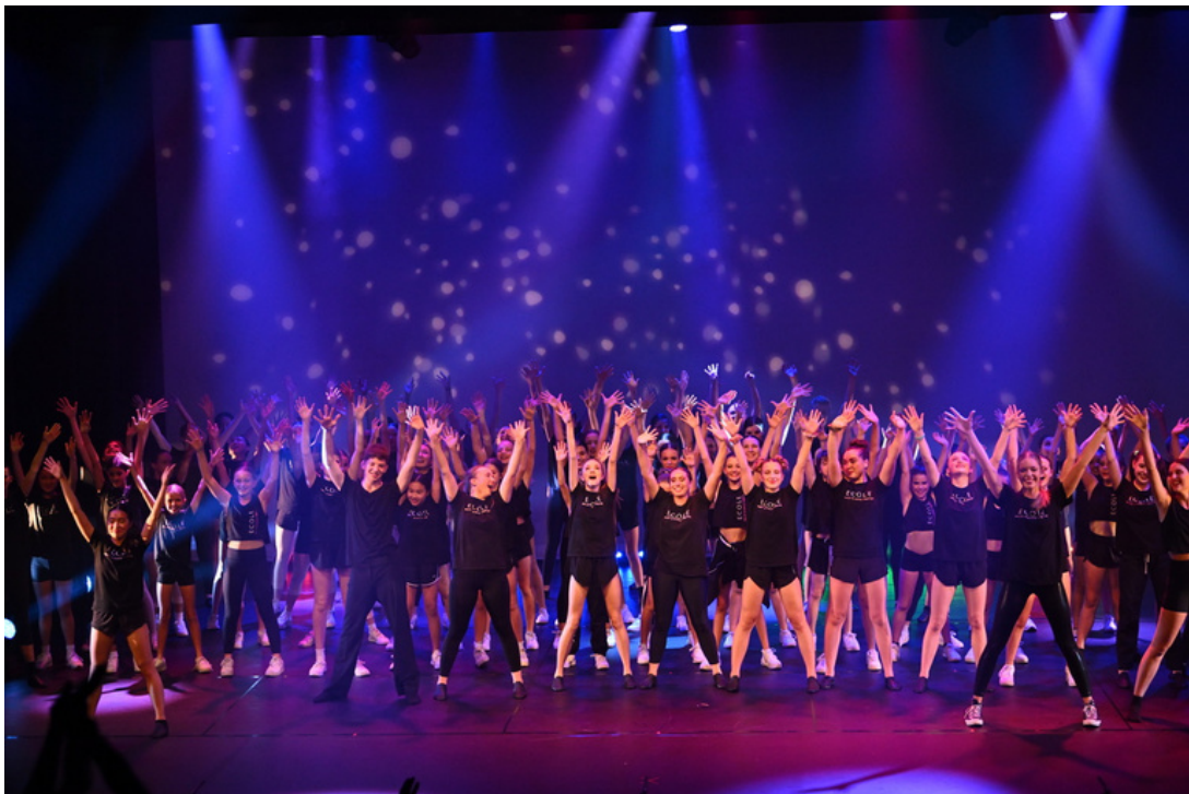
Ecole's 2022 Senior End of Year Performance, Icons of Music & Dance . Pictured is the Finale

We have fitted all of the Junior and Middle School students for costumes. Our gorgeous "The Magic of Disney" and "When I Grow Up" costumes need the final embellishments to make them pop and sparkle on the stage. We would love some help from anyone that can sew. If you are happy to hand sew or machine sew some of the small, finishing details onto the costumes, please sign up to help via this Signup Zone .