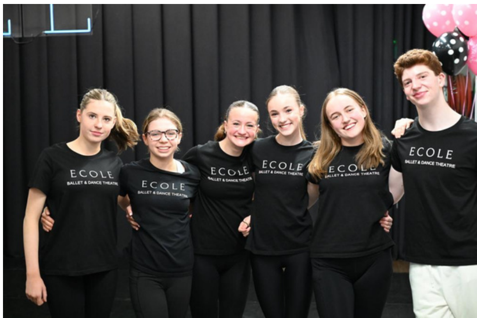
Ecole's Open Day 2023. Senior Students in our Year 11+ Block Class

Make-up classes can be arranged via email, info@ecole.com.au .