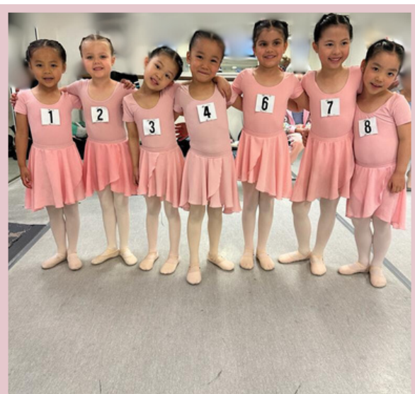
Pictured are our Pre-Primary Ballet students