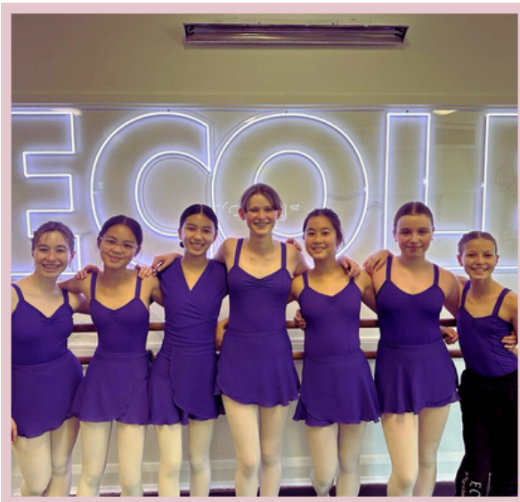
Pictured are our SL6 students who completed their Classical Dance Australia assessment