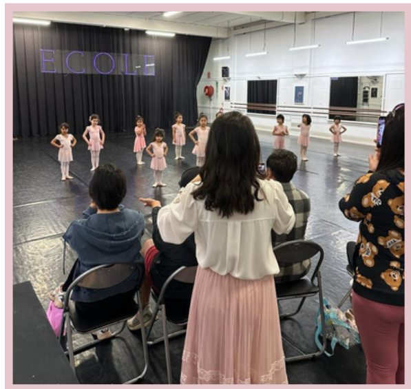
Pictured are parents watching their children at 2023's Family Watching Week

Some classes are not open for Family Watching. Please see the website for further information.